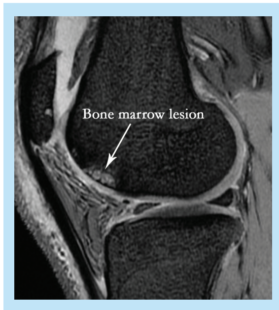
Figure 1. MRI of knee osteoarthritis showing bone marrow lesion.

It is now recognized that the OA process can start in various joint structures including ligaments, menisci or in the bone where the latter has been termed as osteogenic OA [6]. Whether cartilage damage in OA affects the underlying bone or vice versa is still a matter of debate but emerging evidence emphasizes the importance of bone involvement in OA progression. For example, some of the hallmarks of OA include an increase in bone volume and the thickness of subchondral bone [7] as well as the increased number of trabeculae and altered mineralization [8,9]. Another important feature implicating bone involvement in OA is the formation of bone cysts, and the appearance of bone marrow (BM) lesions and osteophytes [5]. BM lesions (BMLs) are usually identified by ill-defined high signal on MRI and comprise of edema, necrosis and fibrosis (Figure 1). They have received increased attention lately due to their 'almost exclusive' association with cartilage degradation and alteration of the articular surface in OA [10]. Osteophytes on the other hand, are fibrocartilage-capped bony outgrowths and a source of pain and loss of joint function [11]. It remains unclear whether the occurrence of all of these bone changes in OA is due to a pathological process or functional adaptation.